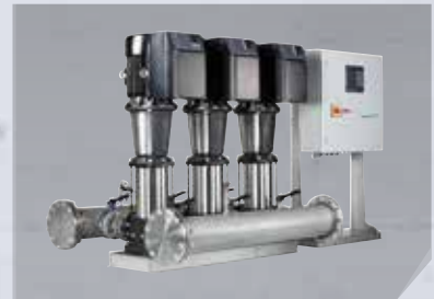
Hydro MPC BoosterpaQ